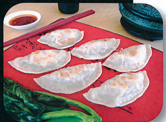
Big Boy Pork Dumplings