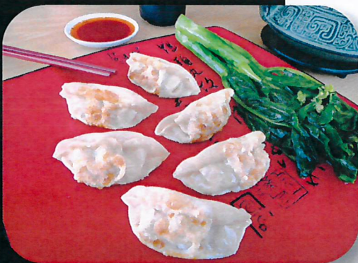
Pork/Chicken Pot Stickers