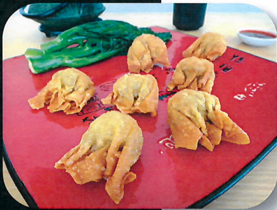
Fried Won Tons