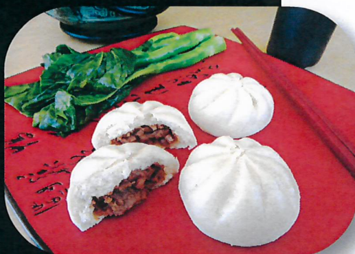
BBQ Pork Bun