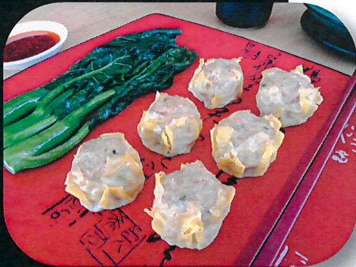
Pork/Chicken Sui Mai