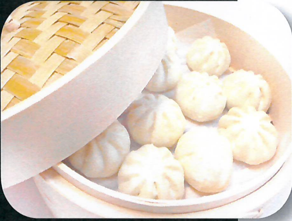
Hot Buns Steamer