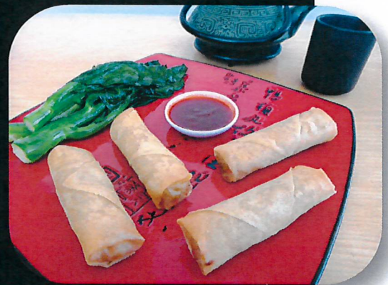
Vege/Chicken Spring Rolls